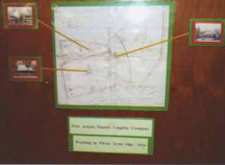
Display in Teak Museum recognizing Display in Teak Museum recognizing