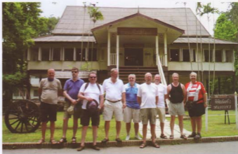
The EAC Group in front of the old EAC Phrae Head Office, now Teak Museum