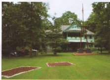
The Inspection Site Head Office