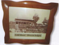
Display of old photo of "Vold Husen", the Manager's residence.

granted the concession for the Me Kampong forest (20 sq. miles). This concession was renewed in 1907. In 1909 the Thai Government made a new apportionment of the concessions and EAC was allotted the district east of Me Yum river (abt. 100 sq. miles). The concession was prolonged to 1936. During the later years EAC employed about 1,400 persons in the